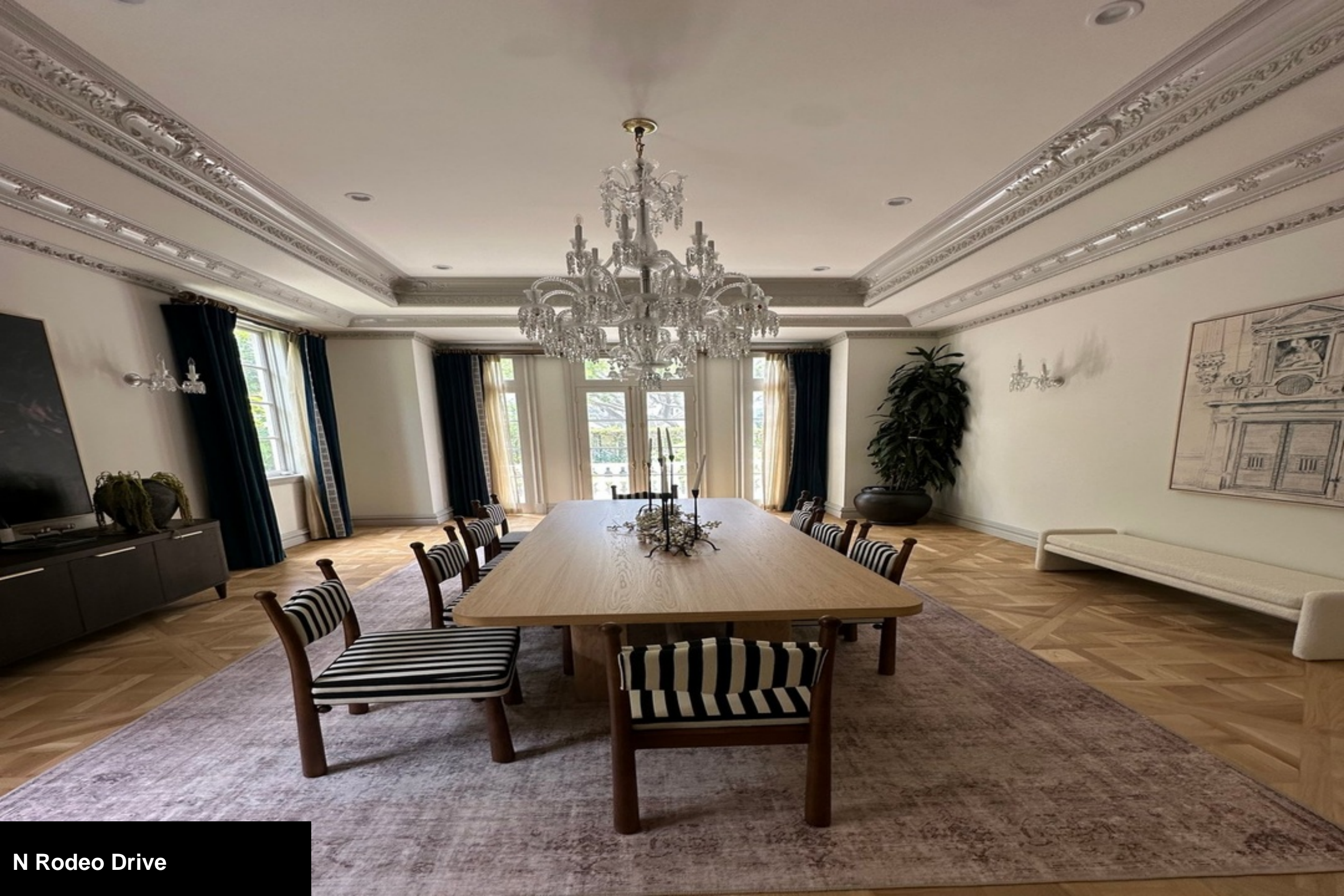
N Rodeo Drive