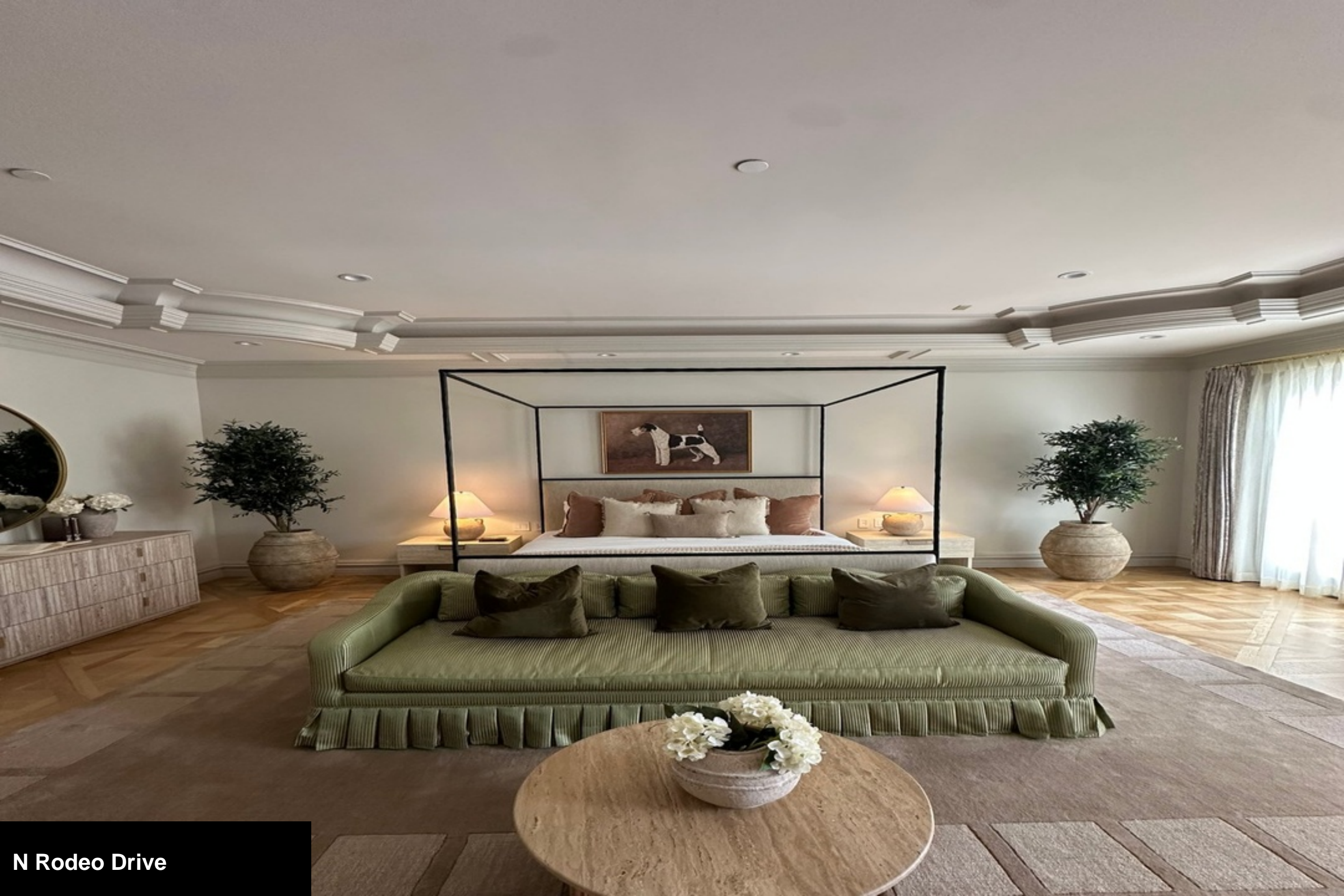
N Rodeo Drive