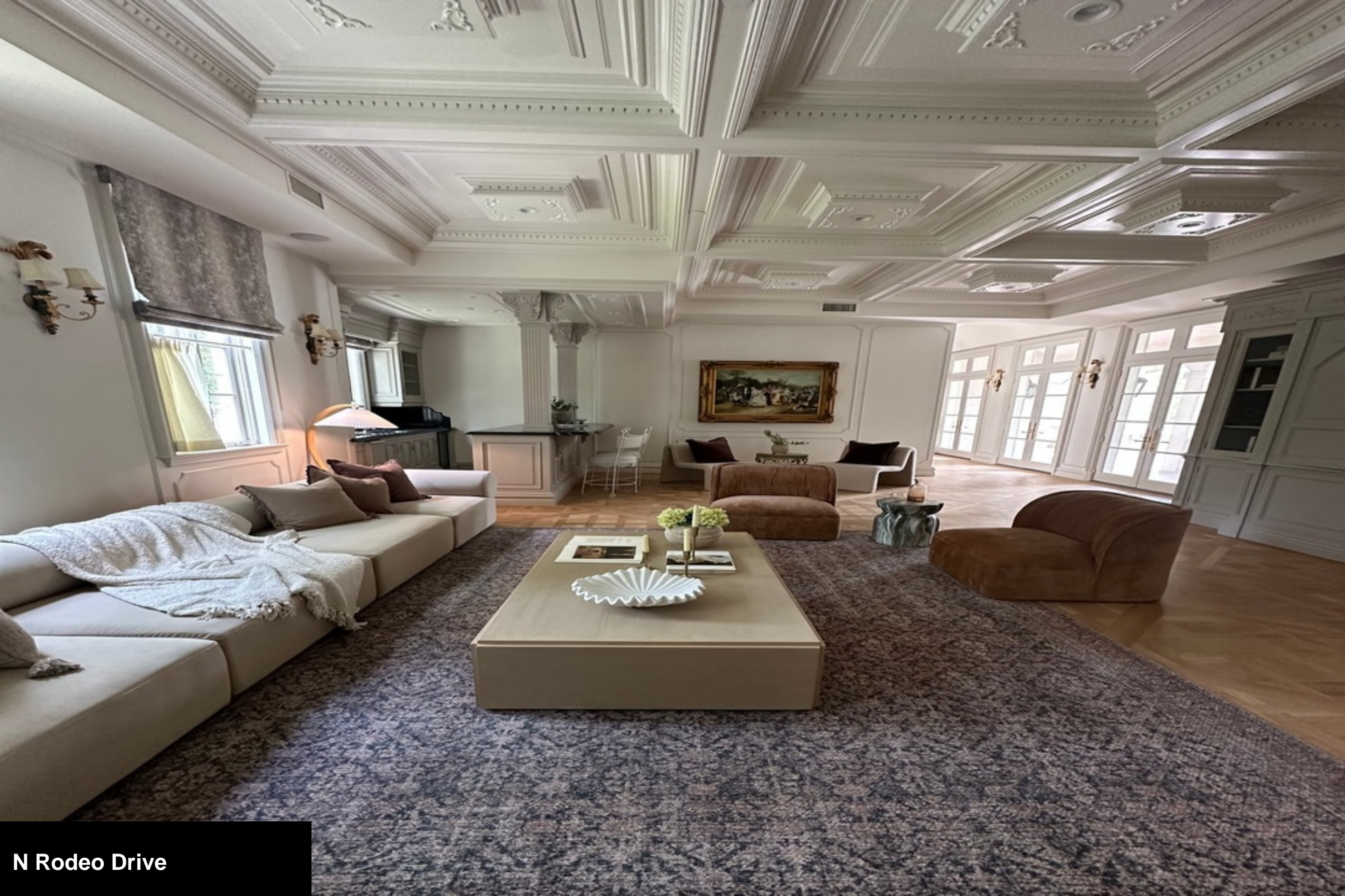
N Rodeo Drive