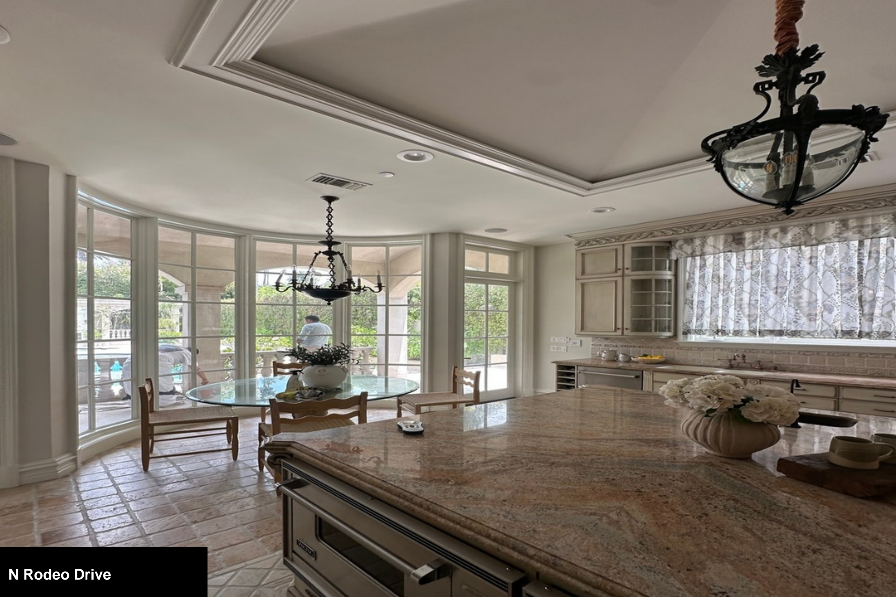
N Rodeo Drive