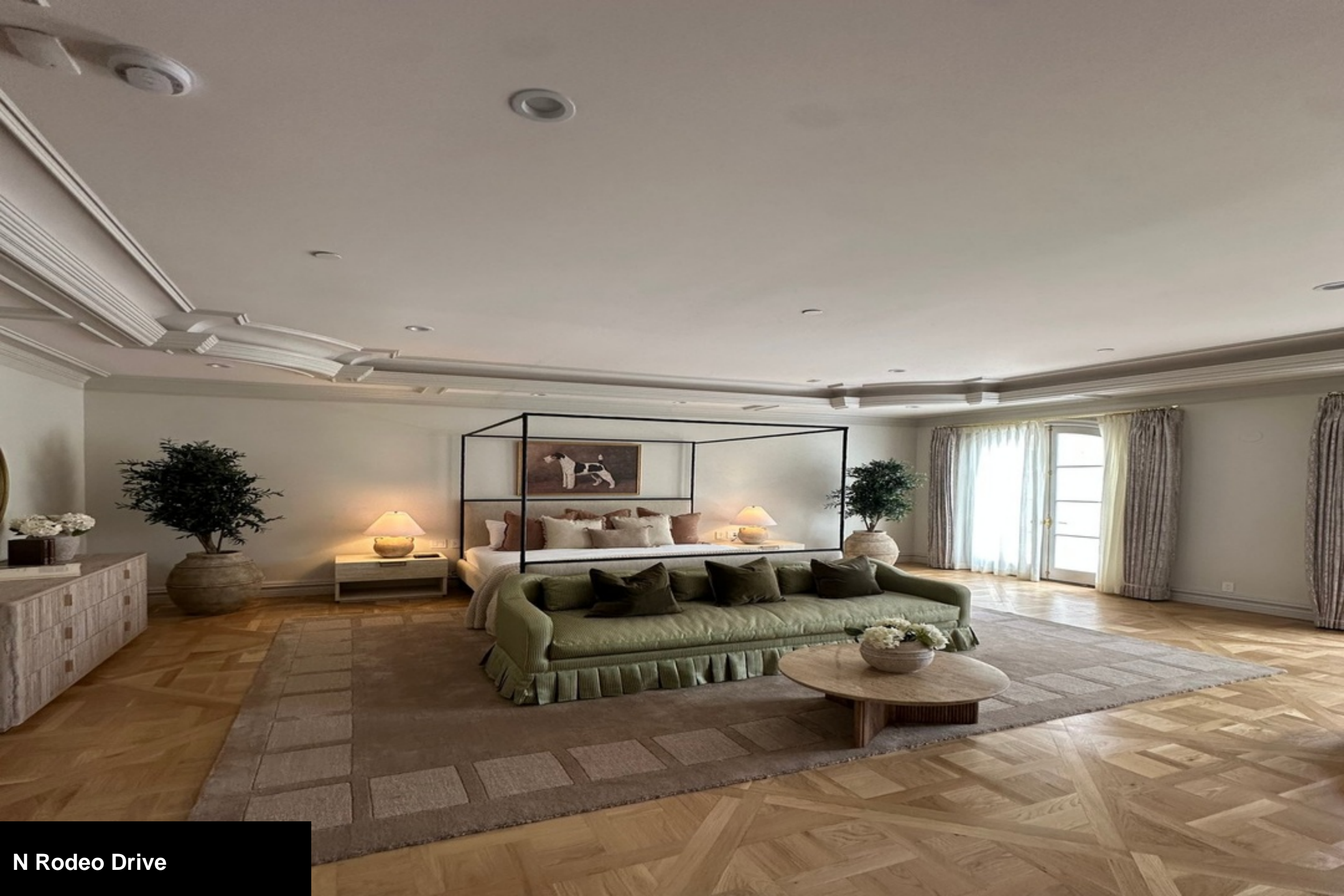
N Rodeo Drive