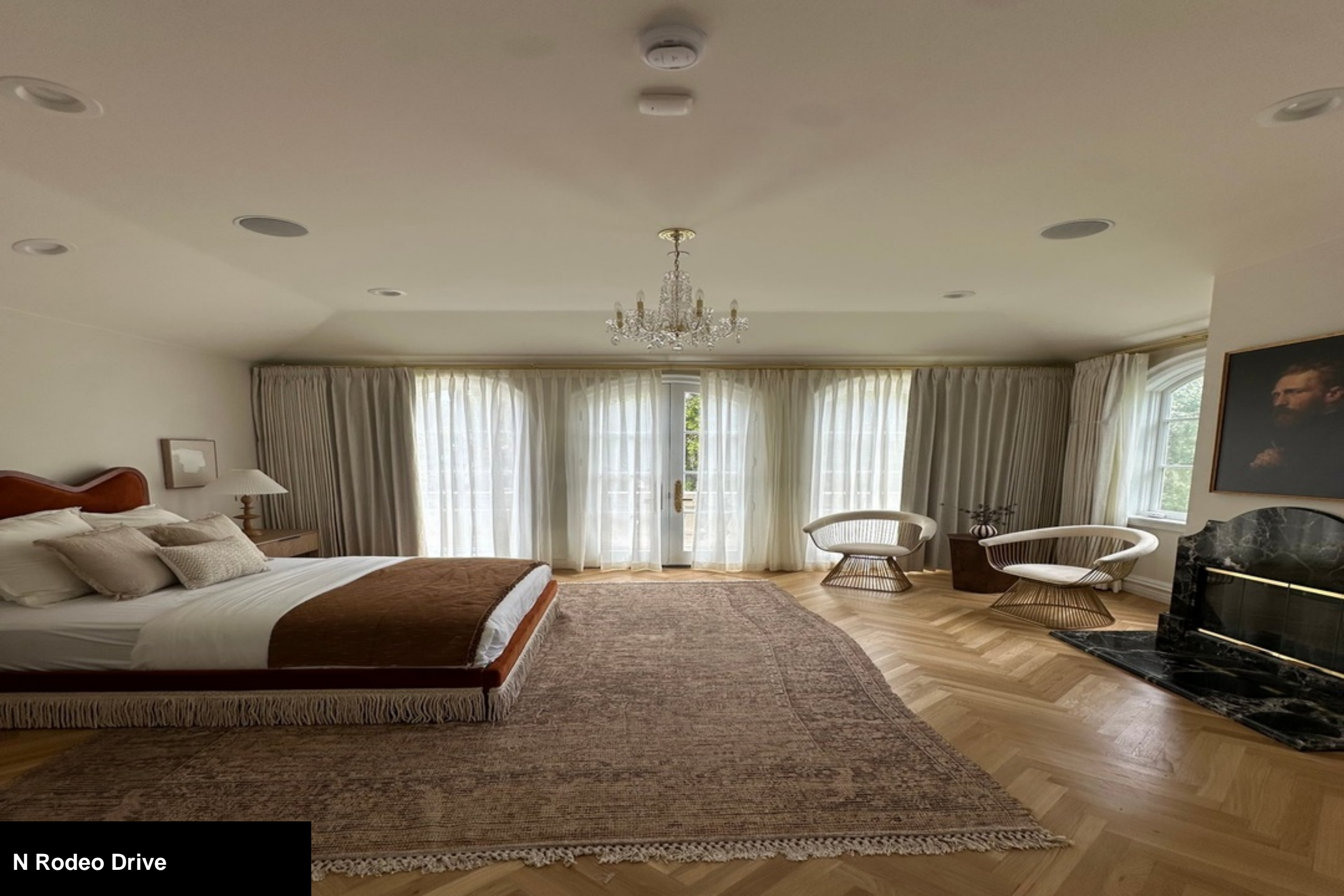
N Rodeo Drive