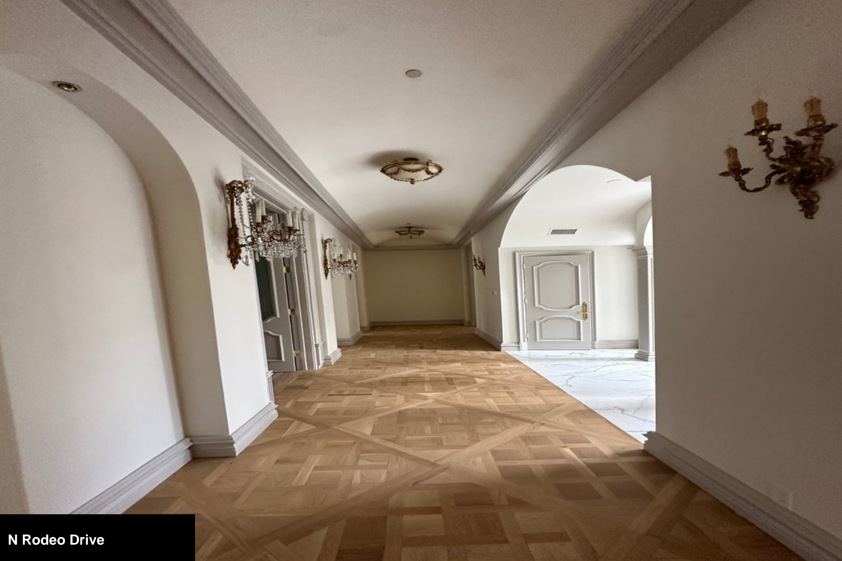
N Rodeo Drive