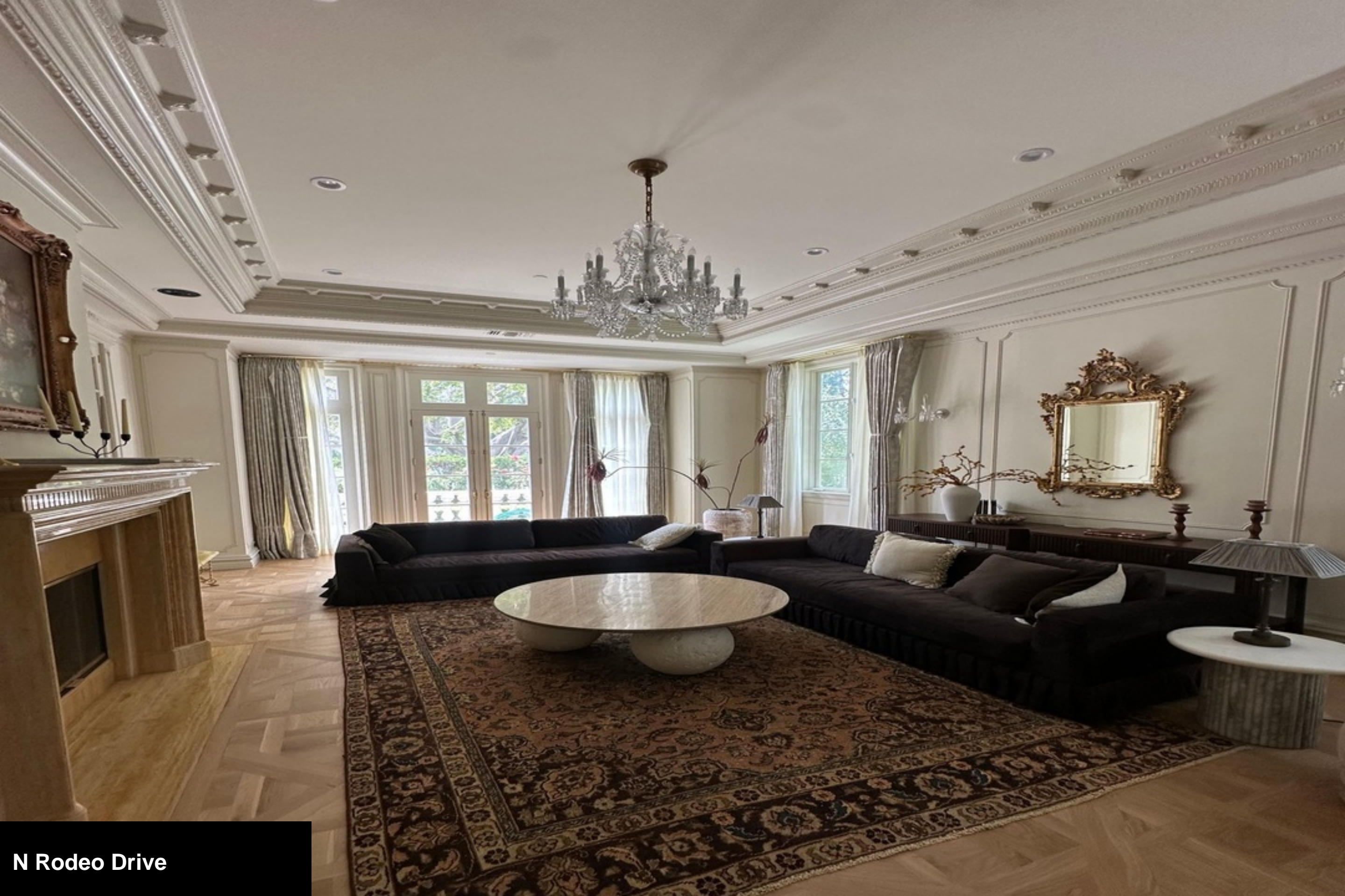
N Rodeo Drive