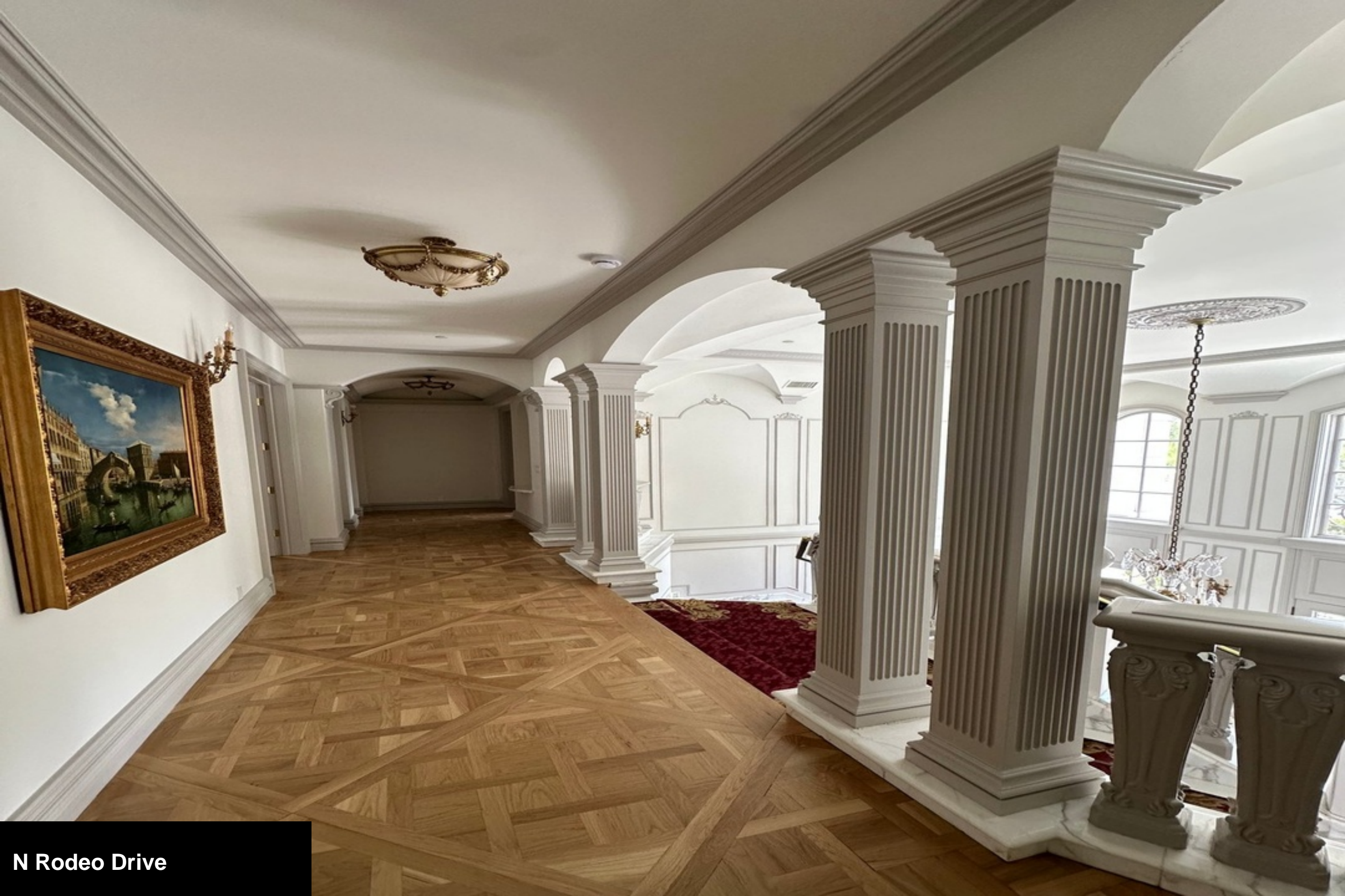
N Rodeo Drive