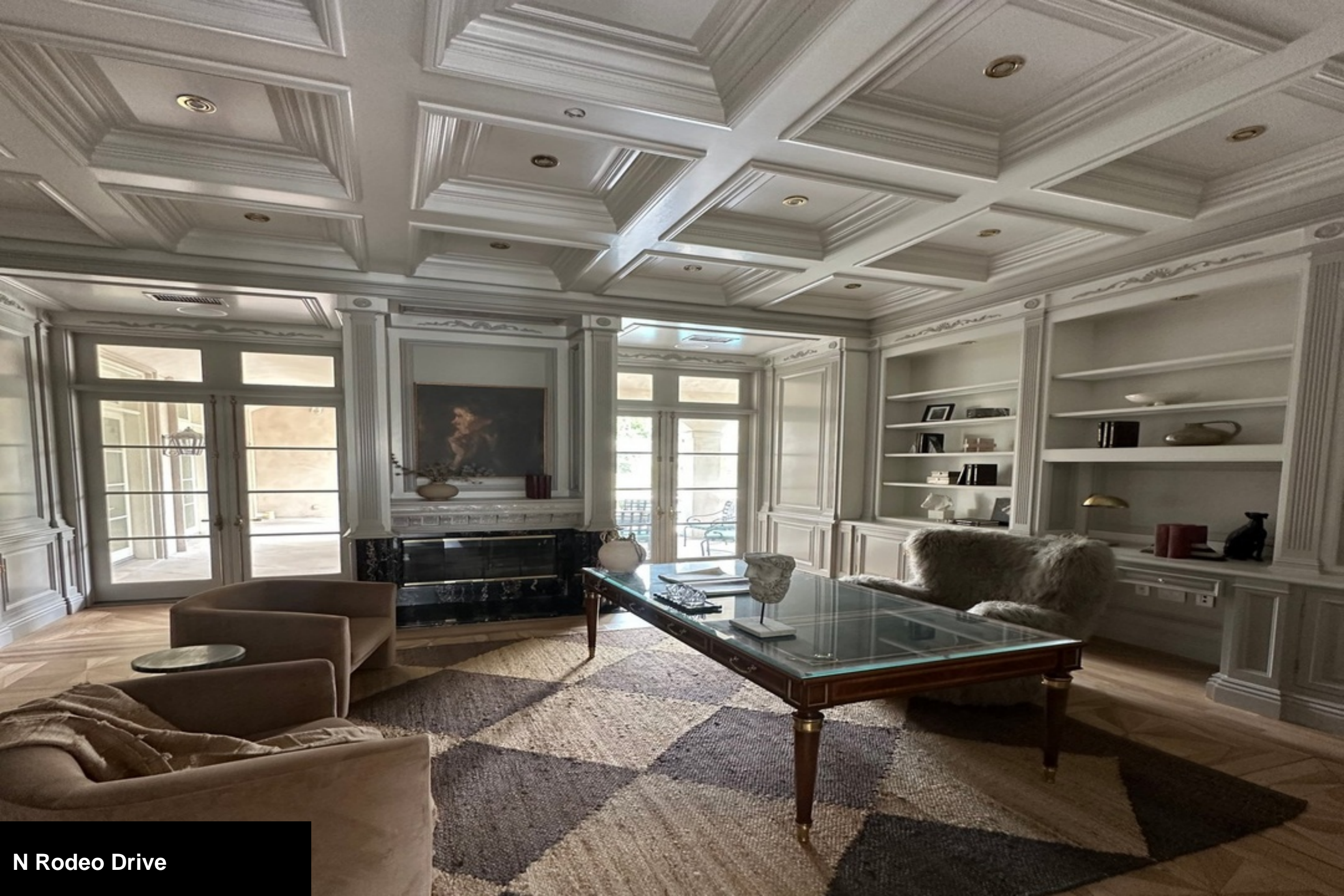
N Rodeo Drive