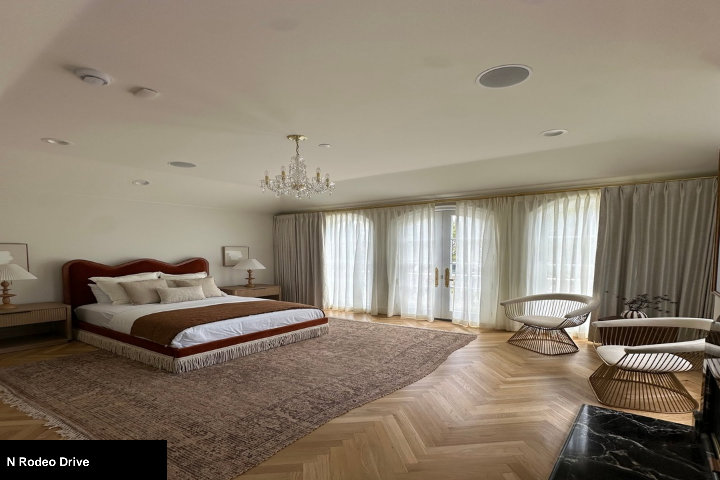
N Rodeo Drive