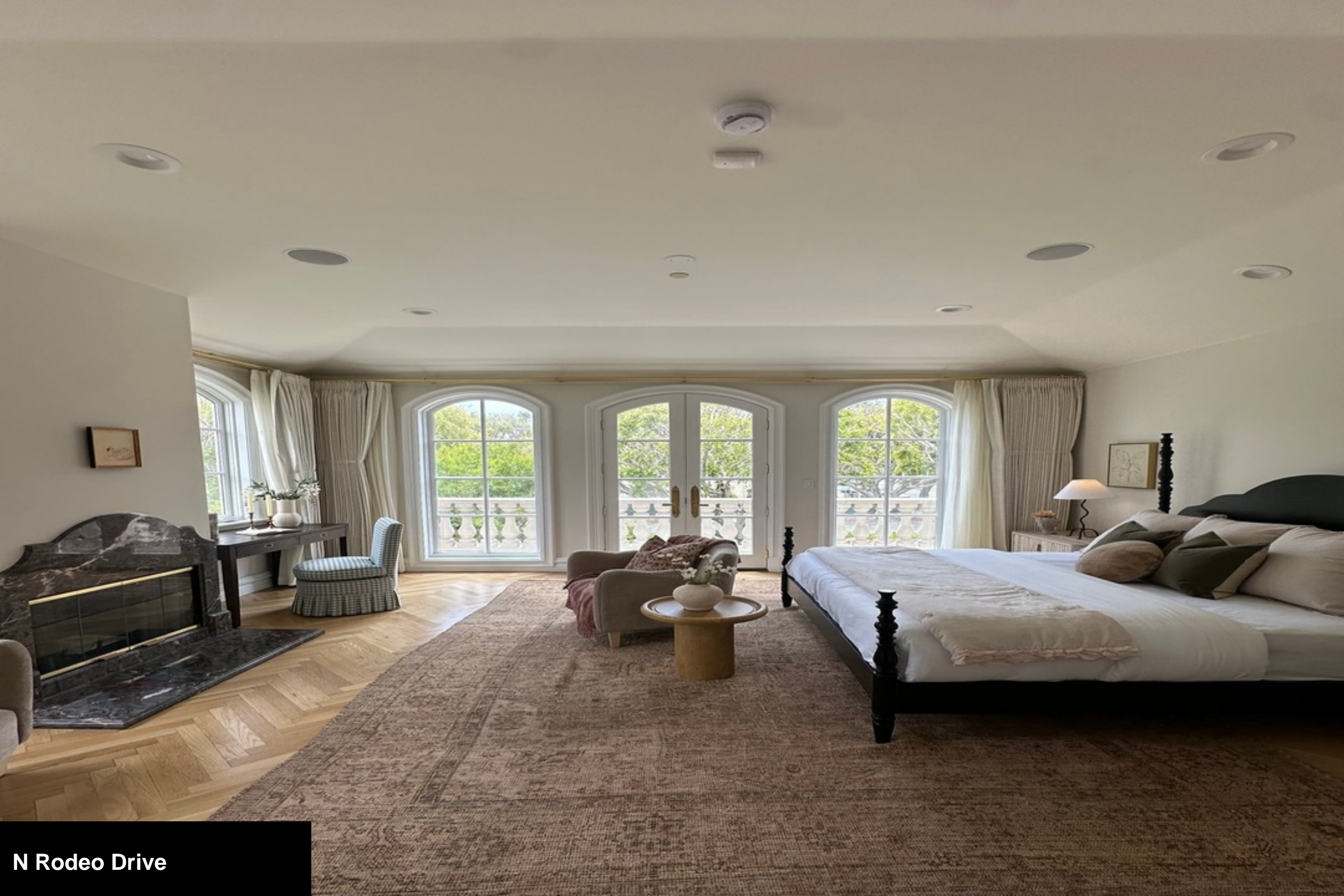
N Rodeo Drive