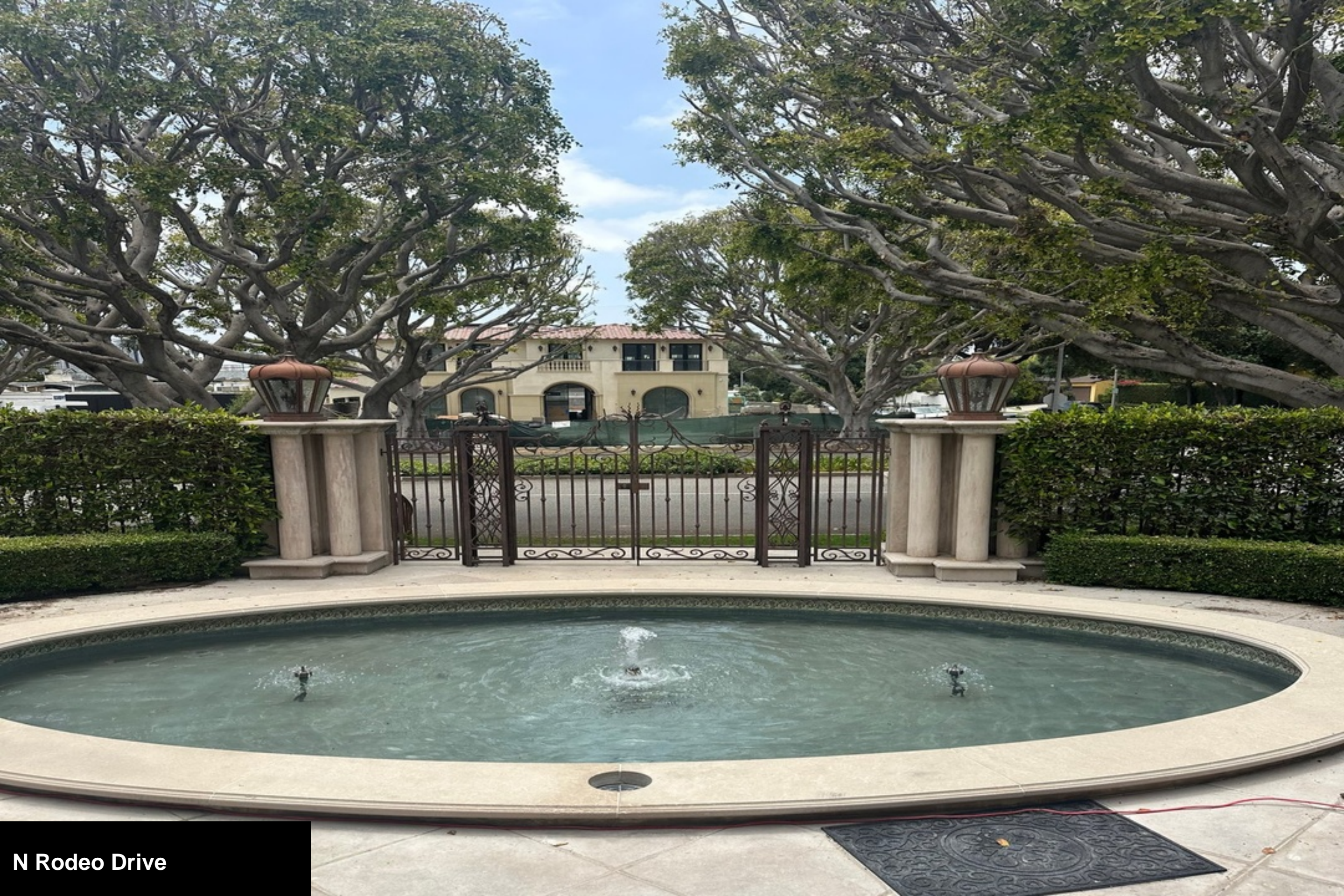
N Rodeo Drive